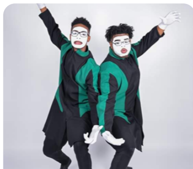
Uncontained Destiny Greenville, Mississippi